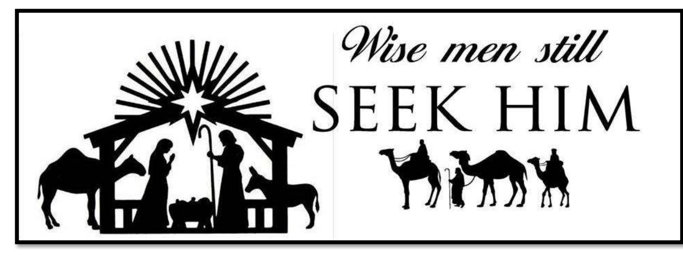
<u>Matthew 2: 1 - 12</u> (New International Version)